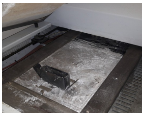
Wave solder pot with dross